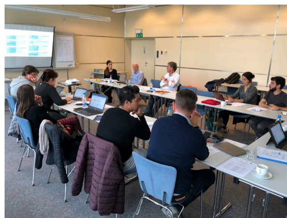
4th project meeting in Ljubljana (Slovenia)