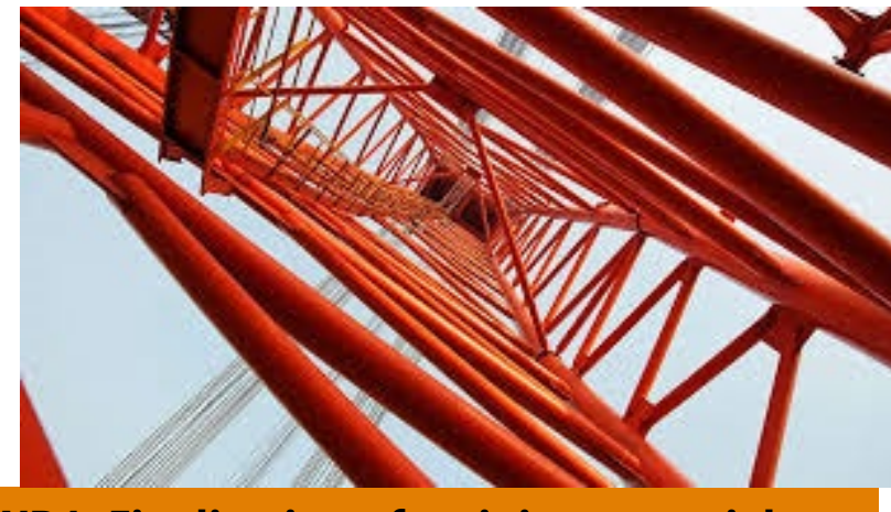
WP4: Finalisation of training material

The project partners successfully completed all focus groups which aimed to evaluate the training material of WP4, 3 focus groups were implemented per country. Each focus group had at least 5 VET providers, 5 employers in the construction sector and 5 representatives of organizations dealing with integration of TCNs in the Labour market. The training material included: